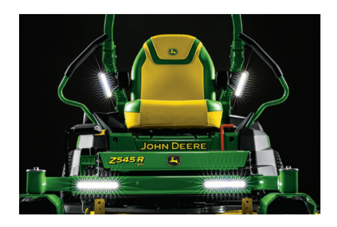
LED lighting helps you keep an eye on where you're going, even in low-light conditions. Standard on R machines and a field installed kit on E and M Series Models.

*Term limited to years or hours used, whichever comes first, and varies by model. See the Agriculture and Turf Equipment Warranty Statement at JohnDeere.com.au or JohnDeere.co.nz for details. **The engine horsepower and torque information are provided by the engine manufacturer to be used for comparison purposes only. Actual operating horsepower and torque will be less. Refer to the engine manufacturer's website for additional information.