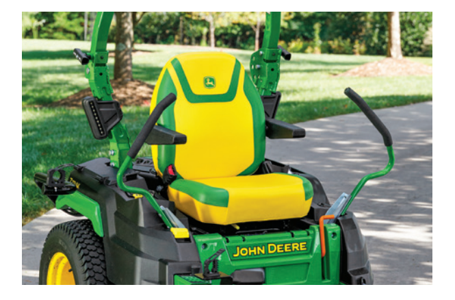
Cut-and-sewn seats add comfort and style to your mower. ComfortGlide<sup>™</sup> fore/aft suspension available on Z530M and Z545R models.

V-twin engine. The 24 HP** (17.9 kW) V-Twin engine has plenty of power, while the 25 HP** (18.6 kW) has an innovative EFI engine.