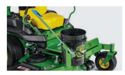
Trash receptacle kit Available on Z700s and Z500s.