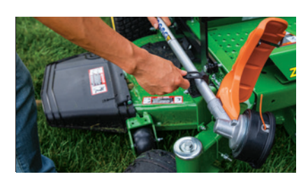
String trimmer rack Available on Z700s and Z500s.