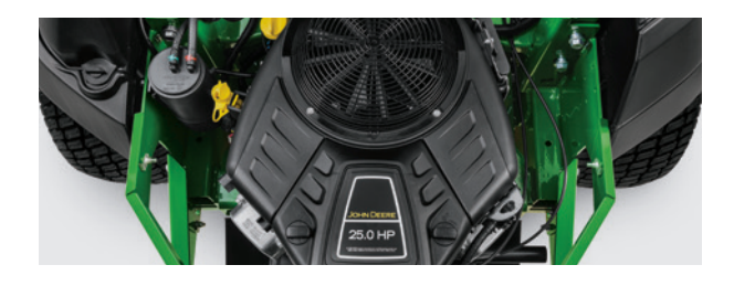
V-Twin engine . 20 HP<sup>**</sup> (14.9 kW) to 25 HP<sup>**</sup> (18.6 kW). For power, reliability, and speed across available ZTrak<sup>™</sup> Mowers.