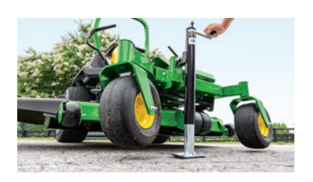
Jack Available on Z700s and Z500s.