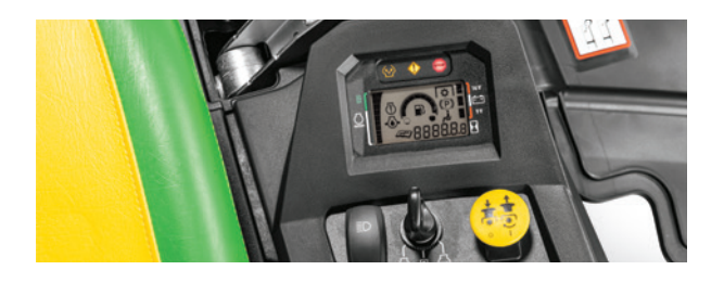
Control console. Ergonomic design and colour-coded for easy identification. Standard on the Z545R model.

*Term limited to years or hours used, whichever comes first, and varies by model. See the Agriculture and Turf Equipment Warranty Statement at JohnDeere.com.au or JohnDeere.co.nz for details. **The engine horsepower and torque information are provided by the engine manufacturer to be used for comparison purposes only. Actual operating horsepower and torque will be less. Refer to the engine manufacturer's website for additional information.